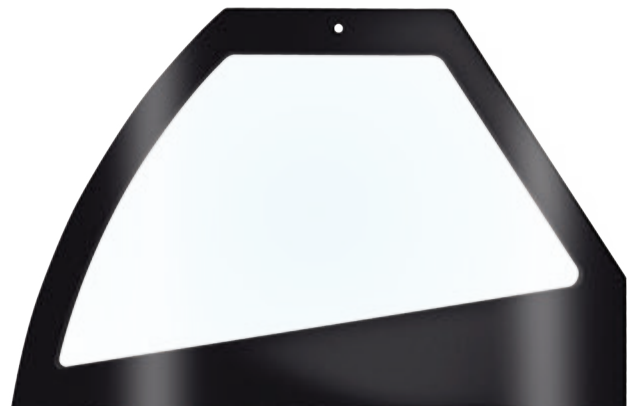
Single side glass with printing