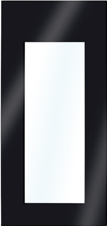
Double pane cabinet side glass with printing and gasket

For commercial refrigeration sector we manufacture single, double and triple ( with and without heater ) curved and painted glasses